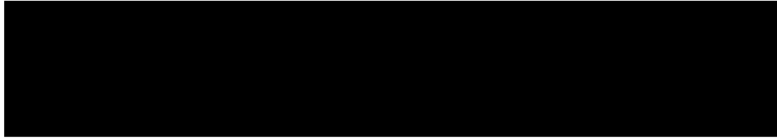
Exhibit I (cont.) CSR Load