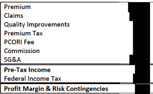
*Figures may not tally exactly due to rounding of the display.

A general description of each expense item is included below.